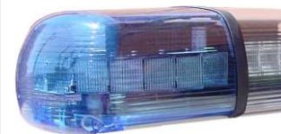
Sputnik LED priority lights

3W Sputnik LEDs modules, front or rear, amber and blue, 12V (synchronized auxiliary lights with priority lights. Only available in 4000 Sputnik Series).