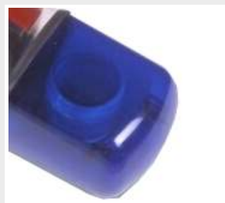
Strobe priority lights