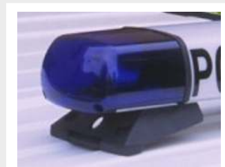
Permanent mount fixation