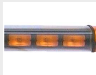
6 modules halogen Signalmaster