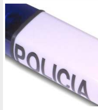
Central illuminated sign

Consult our Commercial Department for configuration.