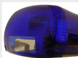
Alley halogen light