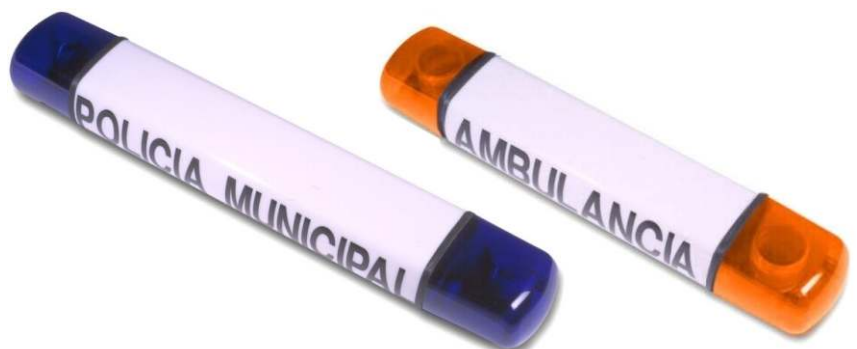
2000 and 3000 Series lightbars