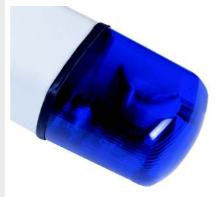
Rotating halogen priority lights