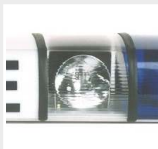
Front halogen light