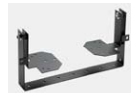
HighLighter LED self-leveling bracket option.