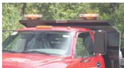
HighLighter LED shown with the riser mount kit option.

The compact HighLighter LED measures a mere 2.7 inches high (permanent mount) making it ideal for amber, police, and fire applications that place a premium on space savings. It is available in permanent, magnetic, suction-cup magnetic mounts, and a variety of other custom mounting options. All HighLighter LED models meet SAE J845, Class 1 specifications.