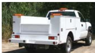
Shown with multiple HighLighter LED mini-lightbars mounted on a box truck.

* Total amp draw depends upon flash pattern used.