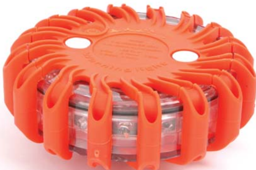
LED Safety Warning Light