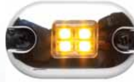
OSA00FCR OSA00SCR warning