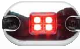
OSR00FCR OSR00SCR warning