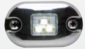
OSC0EDCR white illumination