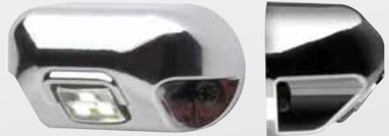
OAC0EDCR 45° bezel step light front & side view